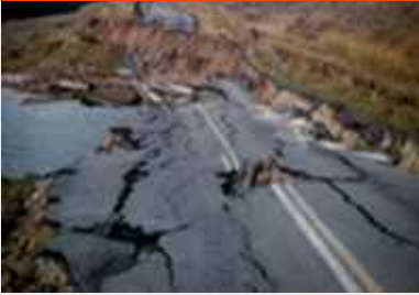
Road damaged due to high rainfall in NE region