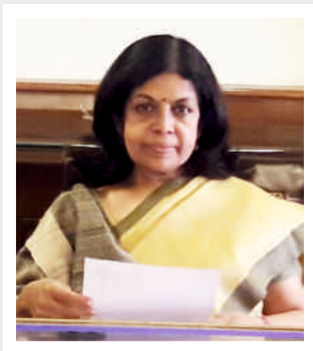
Smt. Rashmi Verma Secretary Textiles, Govt. of India

Government of India Ministry of Textiles