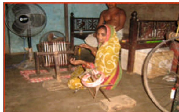
Family member of the beneficiary is engaged in preparatory work