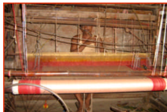
Bata Patra Engaged in weaving