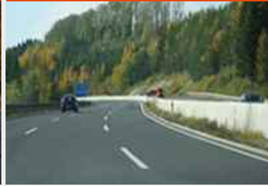
Road stabilised with Geotextiles